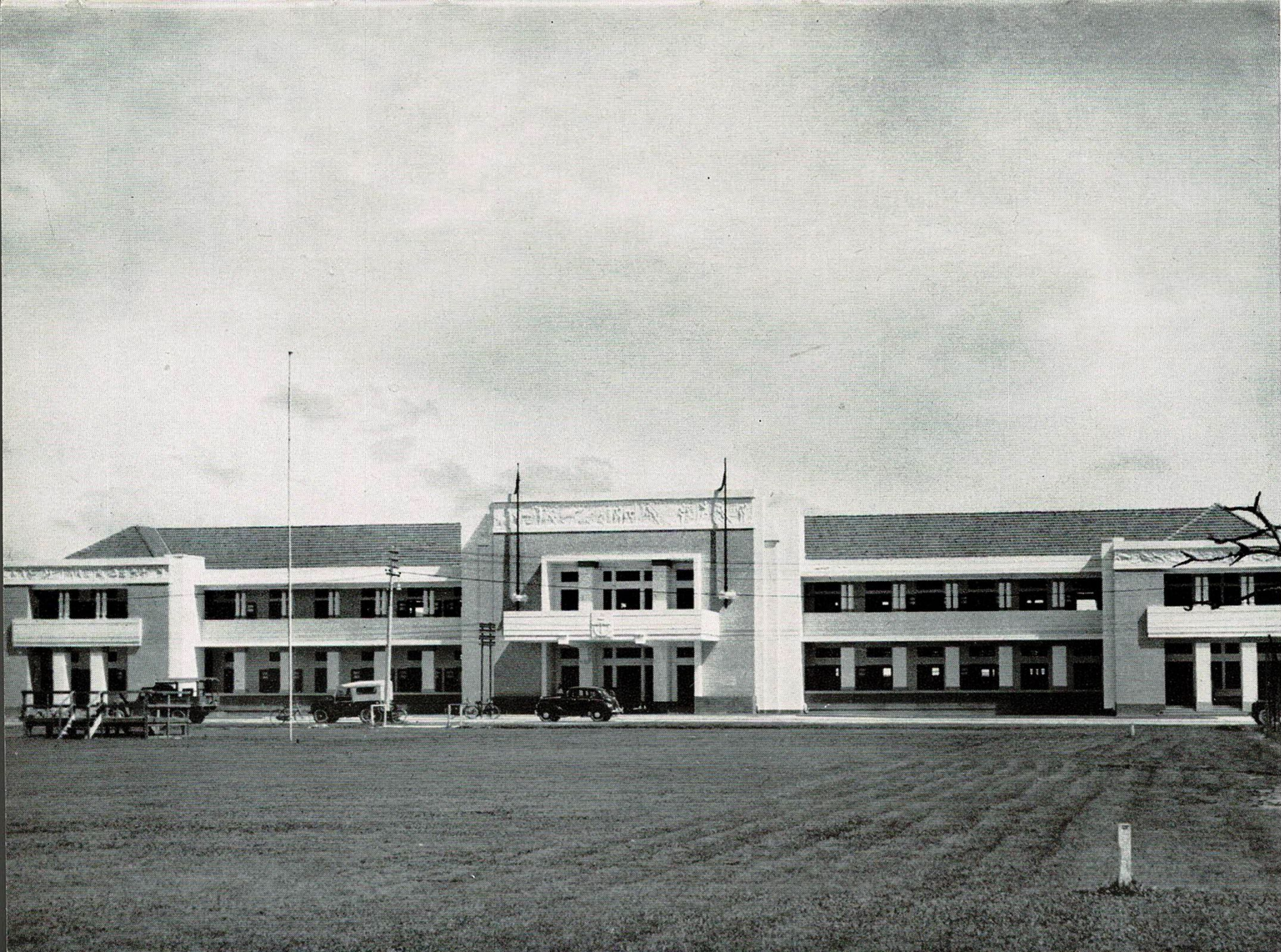
Government Offices, Brunei.